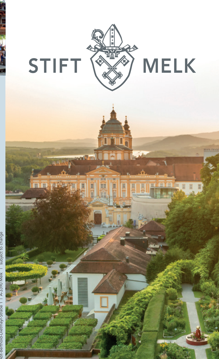
April 2026 | Kultur & Tourismus | Abt-Berthold-Diermayr-Strabe 1 | A-3390 Melk | subject to change